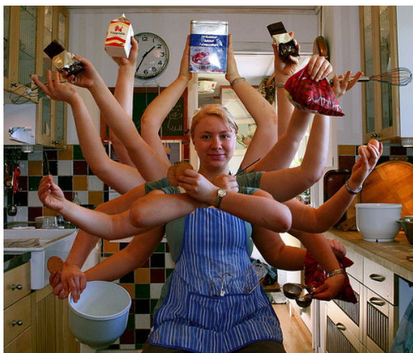
Figure 5. The bookseller

“Booksellers change frequently and they are trained to do several tasks. In the woman with many arms I see their role. They are very interchangeable.”