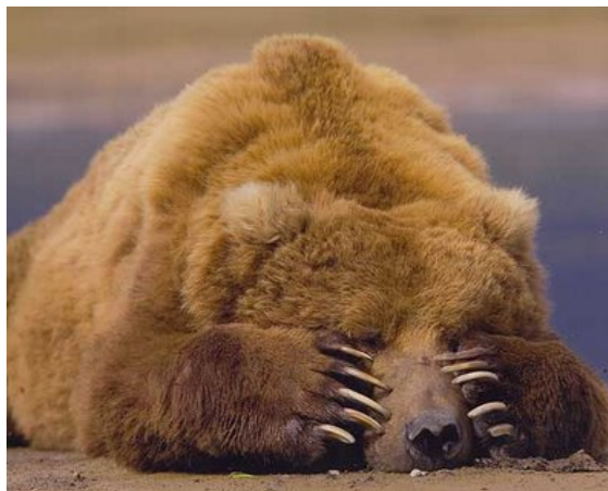
Figure 3. Relationships limited to books

Chiara, a 17 years old non-customer specifically in-depth interviewed, adds: