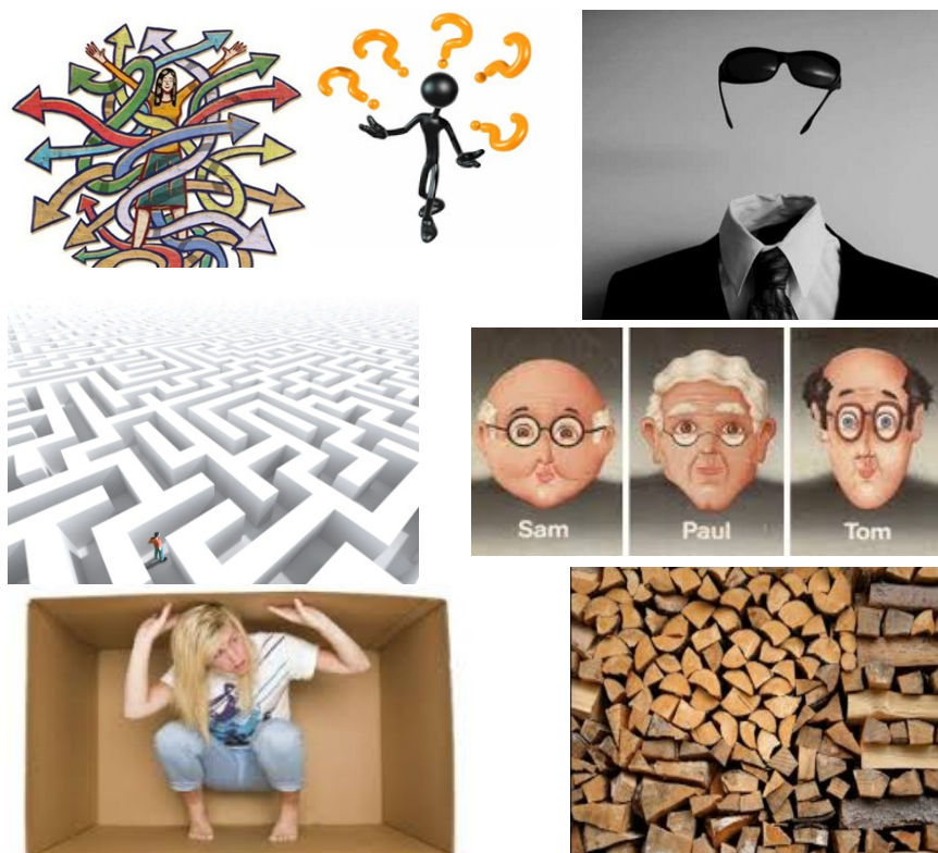
Figure 4. Examples of images related to the confusion in chained bookshops

On the same issue, Enrico, a 29 years old infrequent customer of a small, specialized independent bookshop has a totally different opinion saying: