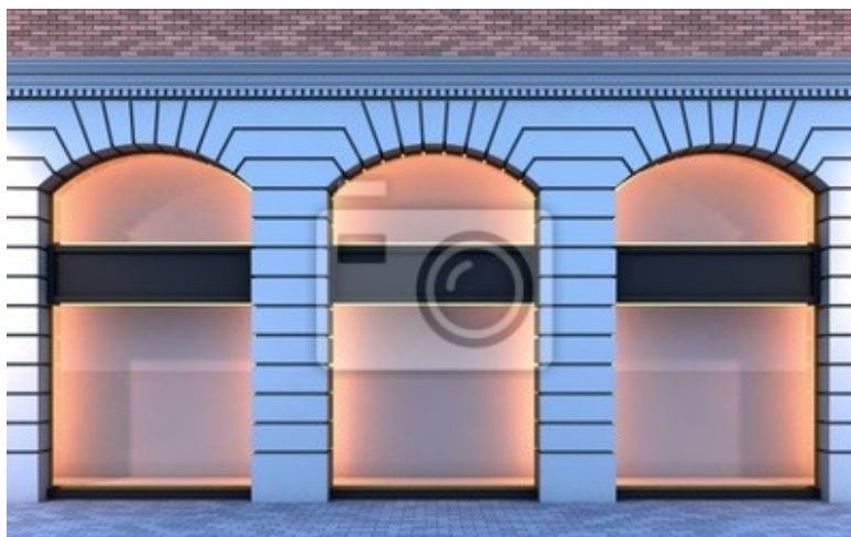
Figure 2. An image about the customer experience in a chained bookshop

Our findings show that commonly bookshops lose a relevant touch-point to create a compelling customer experience when they do not devote attention to their shop windows. On average, only 2% of the observed consumers stop by to look at the windows entering, a stable behaviors in both formats. Instead, attractive, warm, and well-finished shop windows consistent with the concept of the experience can attract the consumers' curiosity so that in front of them on average the observed consumers spend more than 2'. This is quite a huge amount of time and a big lost opportunity for bookshops, especially for the chained bookshops that appear to have more difficulties in managing this feature.