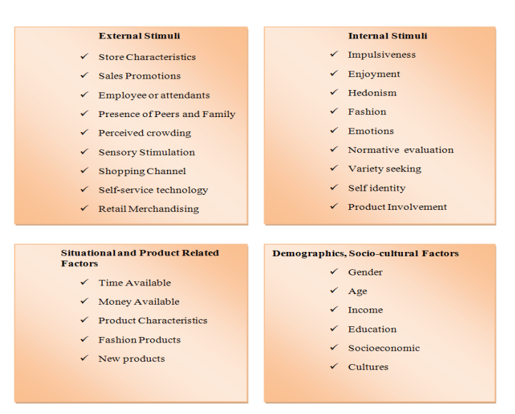
Figure 1. Different factors influencing impulse buying behavior Source: Compiled by authors - Muruganantham and Bhakat