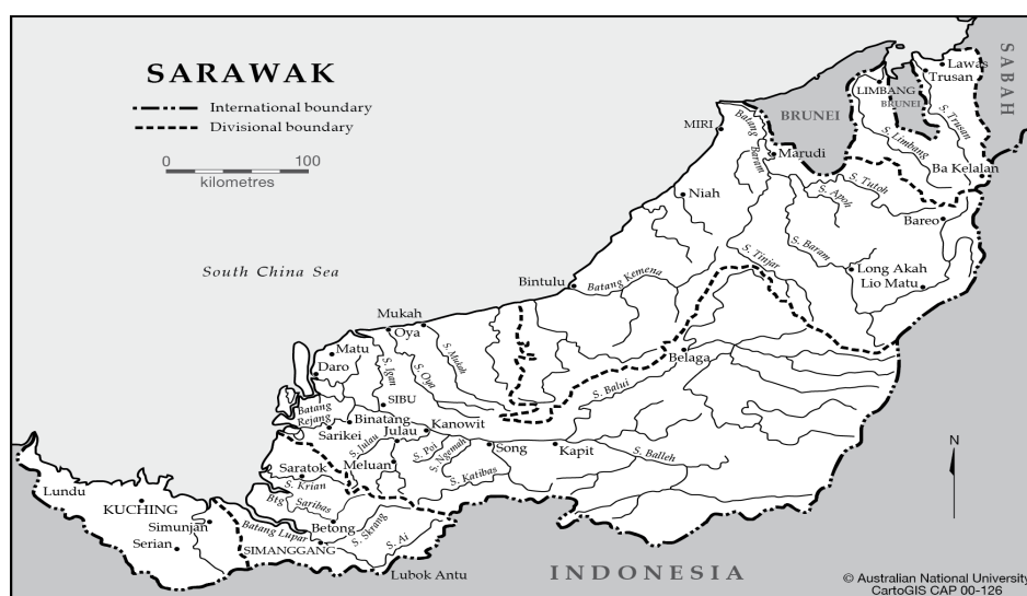
Figure 2. Map of Sarawak

whole of Peninsula Malaysia, 131,573 square kilometres (Furuoka, 2014). Sarawak was divided into twelve divisions which are Kuching, Sibiu, Miri, Bintulu, Mukah, Sri Aman, Limbang, Sarikei, Kapit, Betong, Serian and Kota Samarahan. Presently, most of the major town and cities in Sarawak is connected through Trans-Borneo Highway. Approximately 30,000km of road in Sarawak was constructed by the State Government where the main road route is through Trans-Borneo Highway (Hakim et al., 2018). On the record, Sarawak has more than 40 ethnic groups with each of them own their distinct language, traditions, customs, culture and lifestyle (Colchester, Pang, Chuo, & Jalong, 2009). Based on the statistic reported by Department of Statistics Malaysia (2019), 2.806 million people in Sarawak were categorized into four ethnics i.e., Bumiputeras (Note 1) (75.5%), Chinese (23.7%), Indian (0.3%) and other (0.3%). The study was conducted in the Central Region of Sarawak i.e., Sarikei, Sibiu, Selangau, Mukah, Oya, Dalat (in between Matu and Mukah), and Kanowit (refer Figure 2). Sarikei, Sibiu, Selangau are the middle areas or middle routes connecting the Northern and Southern areas of Sarawak. The total population of the study areas is 484.9 thousand (Department of Statistic, 2020). The ethnic population in Central Region of Sarawak was predominantly of Malay, Iban, Melanau and Chinese (Ting & Rose, 2014).