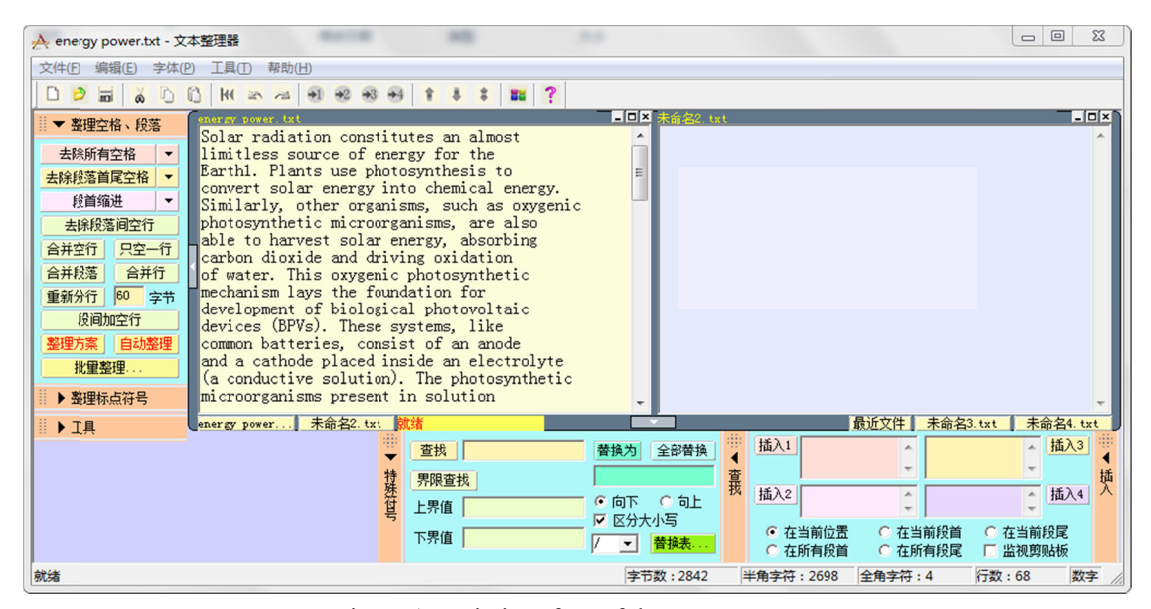
Figure 1. Main interface of the text processor

For further operation, another tool is suggested. PowerGREP is the one that can fully check the visible characters in the text with the aid of regular expression. Compared with EditPad Pro and PowerGREP, text processor is much easier to get access to. (See Figure 1)