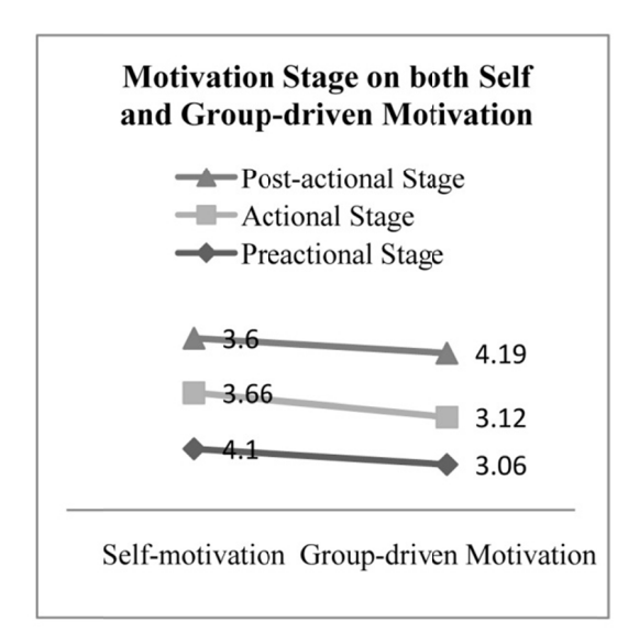
Diagram 3. Three stages of self and group-driven motivations' participants