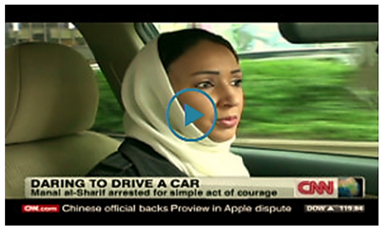
Figure 3. Image shows Saudi woman driving in Saudi Arabia (CNN, October 24 2013)

In the analysis of the way people are depicted, in terms of social distance, the images depict closely Saudi women who are driving their cars in Saudi Arabia. This rendering portrays the closeness of Saudi women, who are struggling to gain their basic rights, to the international readers who are assumed to support their courageous defiance. The analysis of social relation indicates that Saudi women are represented in eye level with the reader to depict their equality with the readers. The examination of social interaction shows that Saudi women are not gazing at the viewer because their act of driving constricts the existence of the eye contact with the reader. Although Van Leeuwen (2008, p. 140) states that when images do not depict people looking at the readers, the image, as a result, forms a "spectacle for our dispassionate scrutiny". In the context of this research, the images positively represent to the reader a spectacle of the courageous defiance of Saudi women to the discriminatory rules of their government.