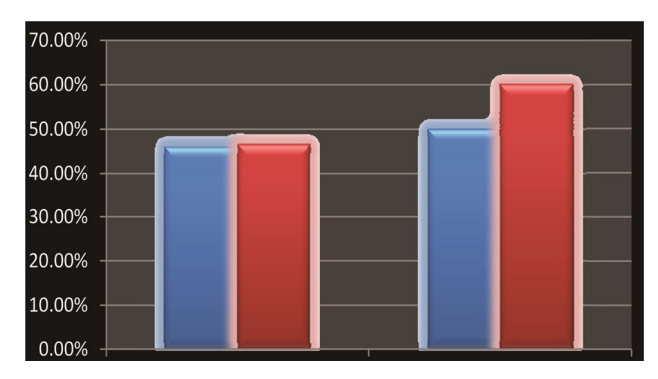
Graph 2. MT and FT mean scores for CG and EG

As shown in the tables 6 and 7 above, the result of statistical analysis for the FT scores shows significant difference between the CG and the EG (p=0.048<0.05). This means that EG exceled CG in terms of academic achievement after the CL treatment. The experimental group which was taught using cooperative learning techniques bears positive impact whereas the control group taught through traditional methods had comparatively less improved results. Graph 2 below shows the difference between EG and CG for the both MT and FT examinations.