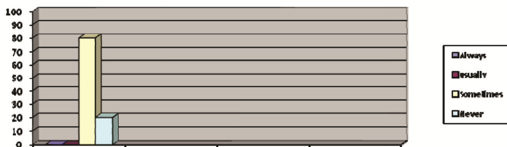
Figure 7. Involvement in selecting the level-2 materials

As shown in figure 7, none of the respondents chose to their opinion for the first two categories i.e. always and usually, while 80% respondents consider that they were sometimes involved in selecting the level 2 materials followed by 20% respondents who were never involved in selecting the level 2 materials.