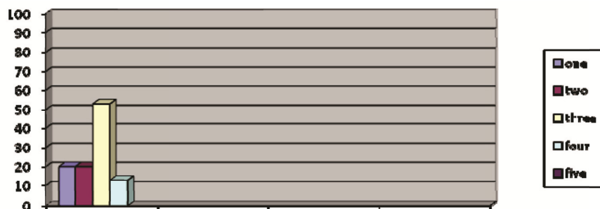
Figure 6. Materials and motivation

As shown in figure 6, 20% consider the materials as least motivating for students. 20% consider the materials as somewhat motivating for students. 53% consider the materials as motivating for students, while 13% consider the materials very motivating for students.