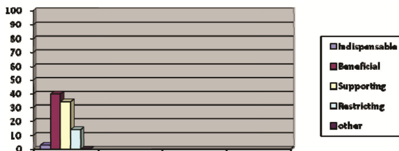
Figure 2. Level-2 materials in respect to objectives

As shown in figure 2, 3% respondents regard L2 materials as indispensable. 40% consider L2 materials in respect to course objectives as beneficial, while 34% see the L2 materials as supporting, while 14% register their concern and regard their opinion for the L2 materials as restricting.