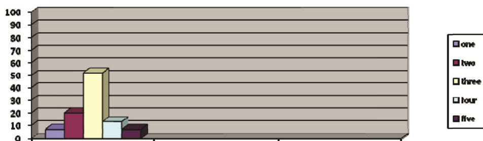
Figure 5. Materials usefulness in imparting the necessary skills

(Scale: 1 is for least useful and 5 is for the most useful)