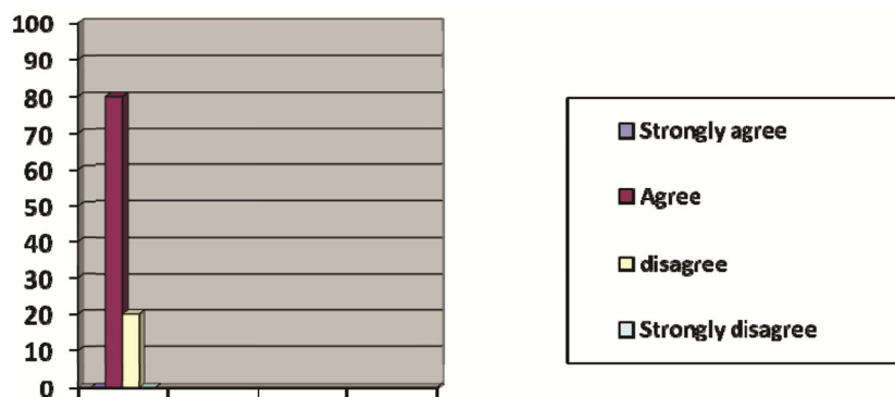
Figure 3. Materials effectiveness and objectives of learning English