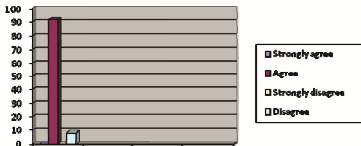
Figure 4. Inconsistencies in English materials

As shown in figure 4, 92% respondents agree with the statement, while 8% decided to disagree with the statement that there have been inconsistencies in the level-2 English material.