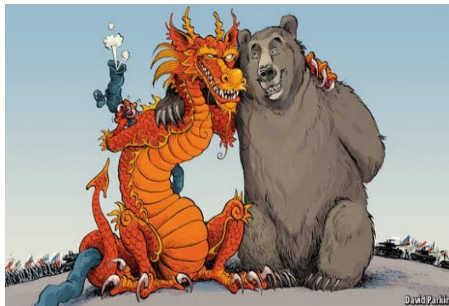
Figure 2. Dragon and Bear from the Economist 5/9/2015