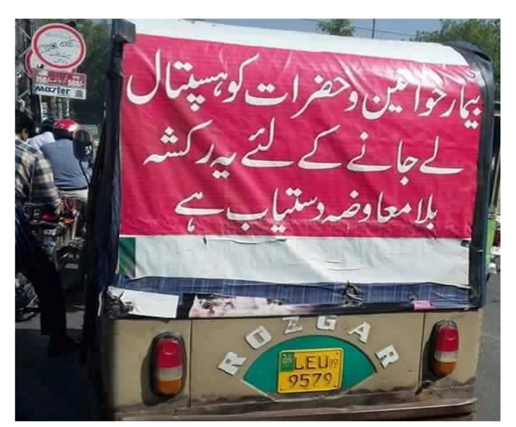
Figure 3. Morality

Beemar khawateen—hazratt ko haspataal lay janay kay liay yeh riksha bil-moawza dasteyab hay To transport the sick men and women to hospital, this rickshaw is available for free.