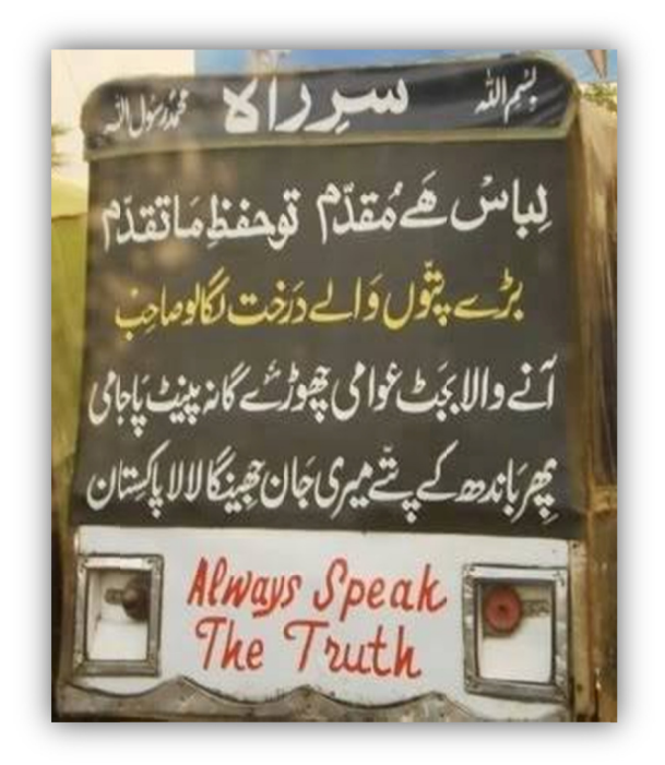
Figure 5. Social economic problems