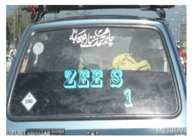
Figure 1. Love