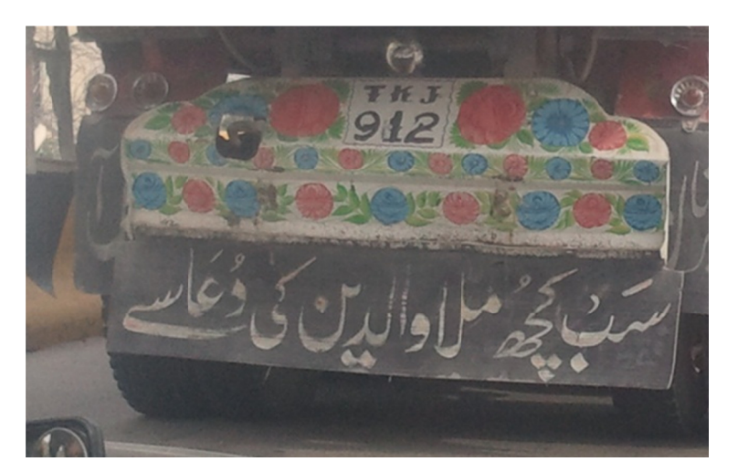
Figure 2. Love