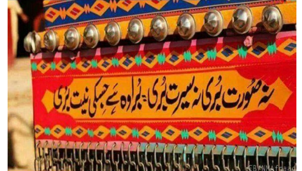
Figure 10. Quotation