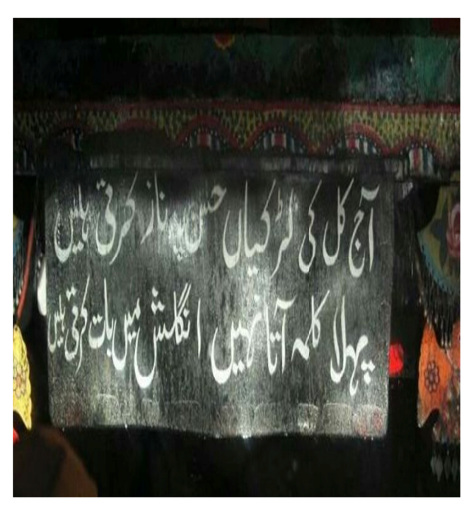
Figure 8. Upward mobility