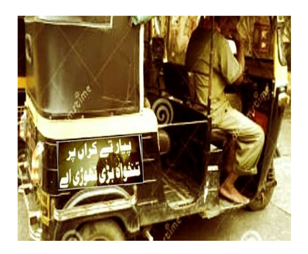
Figure 6. Socio-economic problems