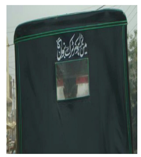
Figure 7. Upward mobility