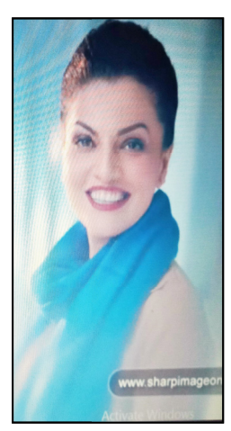
Figure 3. MCB. Ladies Account (2017)

The main crux of the advertisement seems to lie within the verbal commentary initiated by a lady purposefully as this ad is concerned with ladies account, promulgating the attributes of a woman who is accomplished, altruistic and concerned. She is projected as a lady who values frugality and simplicity in life, which suggests the main purpose of this ad that is to urge the ladies to have an MCB Ladies Account. Two images are taken to be analyzed by the researchers to show that how this advertisement has used class differences to gain people's sympathy and attract their interest.