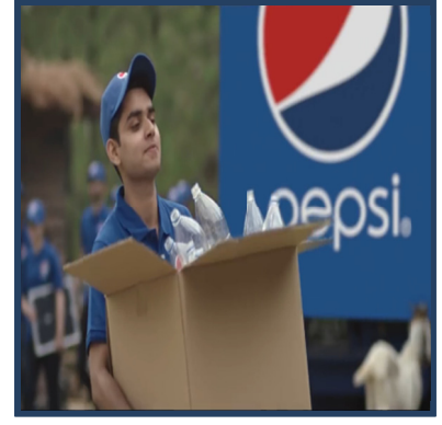
Figure 4. Pepsi Ramadan Ad. (2017)

The story depicted in the advertisement revolves around a girl who belongs apparently to lower middle class, whose father seems to be a daily wager. Since her father has to go to work covering long distance, she wants him to come back home safely in the darkness of the night. This idea projects the main aim that is to gain empathy of