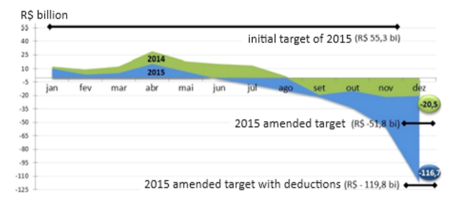
Figure 2. Accumulated Primary Result for the year (2014 versus 2015)

Note. Report of the Special Impeachment Commission (CEI) (Brazil 2016).