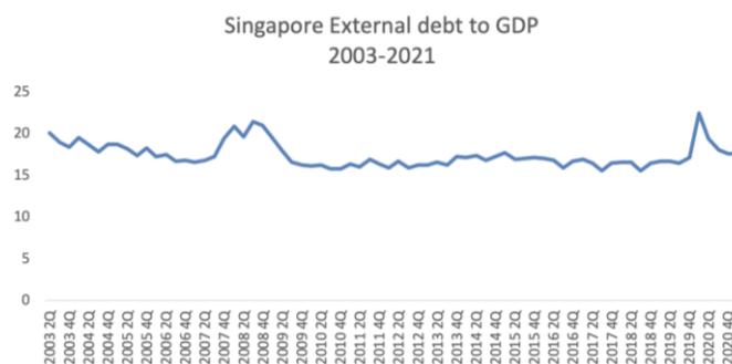
Figure 1. Singapore external debt to GDP from 2003-2001