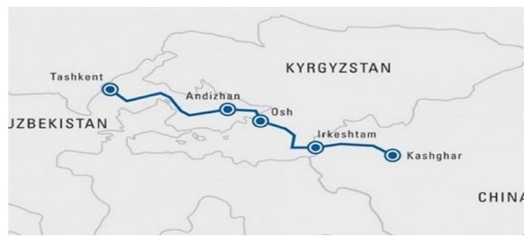
Figure 2. Multimodal Corridor map 1