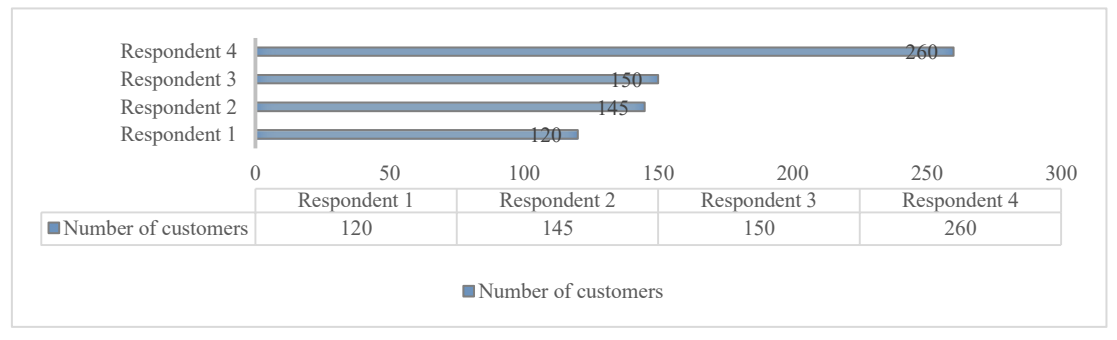
Figure 1. Number of customers

Figure 1 shows that the average number of firms using invoice trading financing is approximatly 169 firms per platform; this result is affected by a platform, which records a number of customers considerably greater than the other three (260).