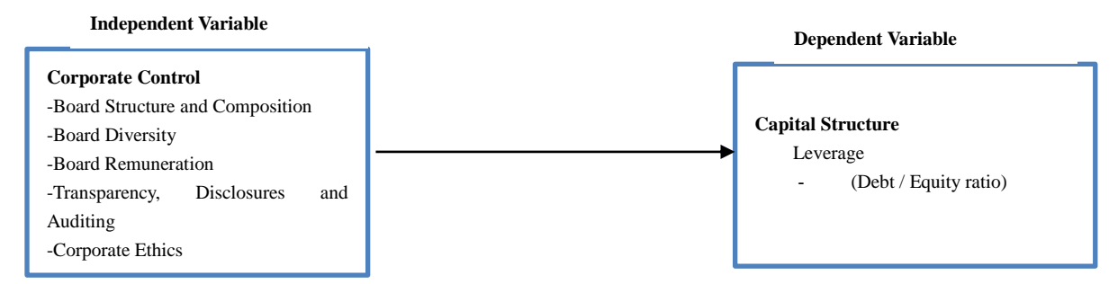
Figure 1. The conceptual model

The conceptual model is a model indicating the linkage between the variables identified for the research. H_1 indicates the link between independent variables (corporate control) and response variables (capital structure). Corporate control variables such as board structure and composition, board diversity, board remuneration, transparency, disclosures and auditing and corporate ethics are expected to have a significant effect on company performance based on return on resources and Tobin Q. This ties in with results of Black et al. (2006) who found a positive linkage between corporate governance and company value and used the same measurement variables for company value.