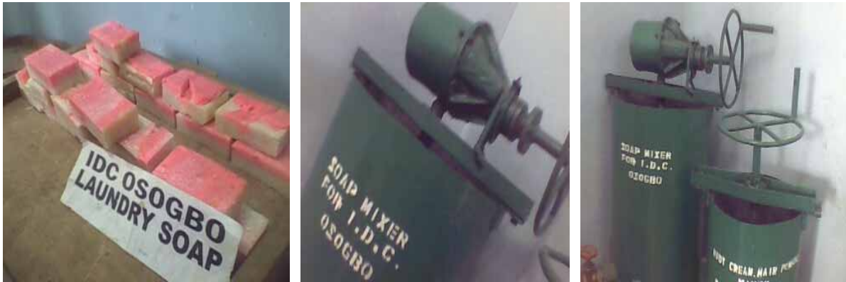
Laundry soap and mixing machines, Food and Chemical Department of IDC, Osogbo, Nigeria