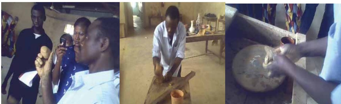
A staff of IDC, showing students the rudiments of making tea-cup out of clay