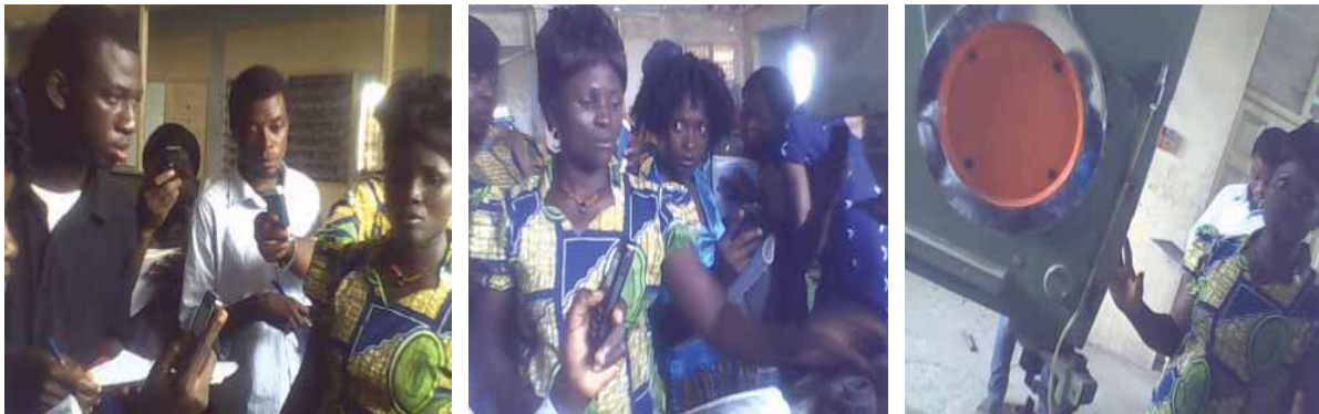
Students receiving training on how to use machines to cut metal in Metal department of IDC