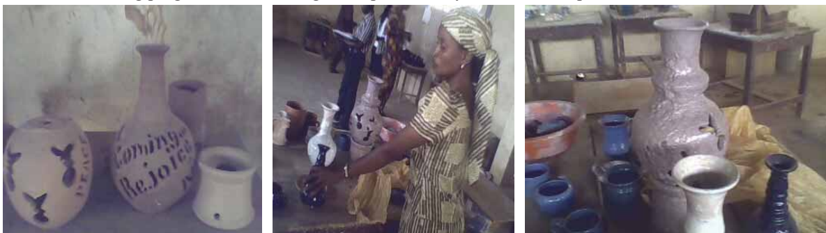
Ceramics Materials produced at Industrial Development Centre (IDC), Osogbo, Nigeria.