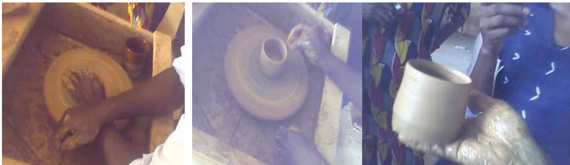
One of the training programmes in making tea-cup out of clay in Ceramic Department of IDC.