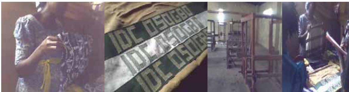
Batik and dyeing materials produced at Textiles Department of IDC