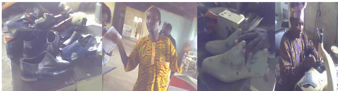
Leather Department where entrepreneurs are being trained on how to use leather to produce materials like leather shoe, leather bag, leather belt e.t.c.

Source: Research Data, January, 2010. (By Hassan & Olaniran)