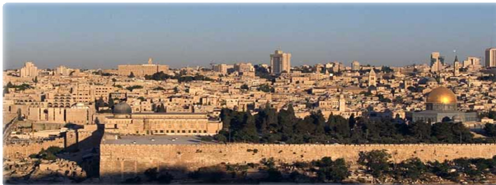
Figure 1. Jerusalem (Al-Quds)