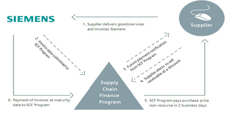
Figure 2. Supply chain finance

Such SCF products offered by giant multinational groups are specifically for chosen suppliers of that group. Being a multibank solution and a cost-efficient approach, it enables suppliers to convert their outstanding bills into non-recourse cash at a very attractive discount rate. The Supply Chain Finance Program enhances the income of chosen suppliers and upgrades their working capital. The participation amongst organization and its providers will turn out to be much more effective with the use of the SCF Program.