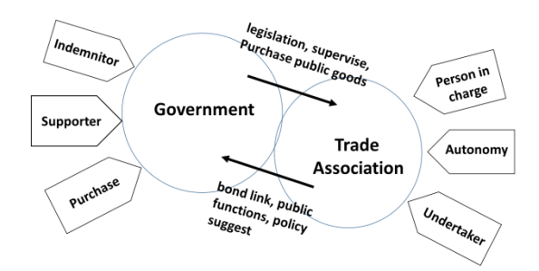
Figure 2. New relation model of the government and trade association

Therefore, as the important main body for reconstructing the relation between the government and community, the government and trade associations play different levels of roles. The responsibilities of the government mainly lay in institutional aspect and resource allocation aspect. The government provides the effective resources and equal competition through establishing the institutional environment of complete trade association survival and development. The responsibilities of trade association mainly lay in the actual operation level, adapting to demands of market and enterprises, constantly completing and expanding the services to members, participating in public affairs, and maintaining the market order. Fig. 2. represents the reconstruction model of the new relation between the government and trade association.