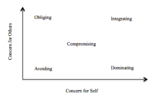
Figure 1. Conflict management styles

therefore, a consequence of organizational (and workplace) communication within organizations (Cetin & Hacifazlioglu, 2004). Figure 1 illustrates the 5 main conflict management styles.