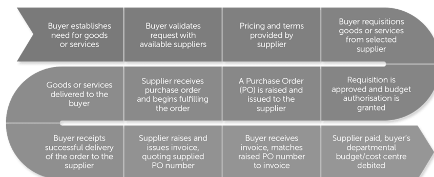
Figure 1. Procurement and payment process

The procurement process, which is depicted in Figure 1, has seven steps: tender opportunity, qualification, invitation, bidding, presentation, selection, and contracting. In this stage, identifying tender opportunities is an internal state or city process that occurs when a city or state agency or department requests an order. The state will examine the request and qualify them based on state budgeting and planning. After the agency sets up their order's requirements, they will invite sellers. Selecting the bidders is another process in which some sellers are not qualified or have an unqualified reputation. After the agency announces their tenders, the invited sellers will bid. After the seller presents its goods or services, the state will select the lowest price with the highest quality. The state or agency will create a contract with all of the requirements and the time frame for meeting obligations. After the seller provides the goods or service, the agency will process the payment. The payment goes through different stages: invoice submission, bill recognition, invoice processing, crediting the amount from the state or city, invoice completion, and lastly, payment.