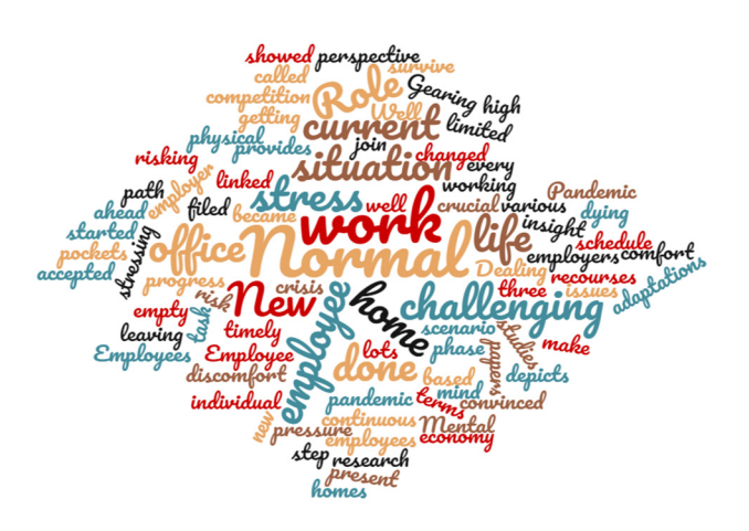
Figure 2. Word cloud

The Feature extraction shows the focus of the HR leaders and industry on the role of HR with more word counts in the reviews and the articles, while employee well-being was the second most attended area of interest. New normal being the common phenomenon was less talked and the pandemic being the negative term was less addressed issue.