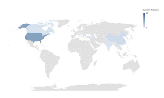
Figure 2. Geographical map of the provenance of the qualifying studies

Of the aforementioned 48 studies conducted in a single country, 39 studies come from high-income countries and nine from upper-middle-income countries. Only one study comes from lower-middle-income country, and another one from low-income country.