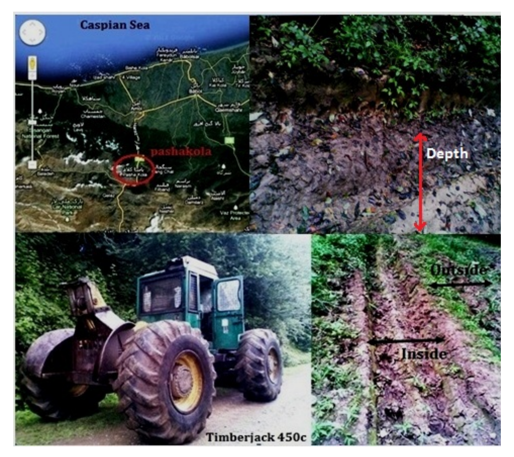
Figure 1. Map and Geographical location of the study area and Skidding operation

Pashakola forest is located south of the city of Savadkooh in Mazandaran province, Iran (Figure 1). Large areas of these forest are located on steep to very steep slopes with an average altitude greater than 1000 m above sea level. The main system for wood extraction in the Pashakola forest is based on ground skidding by Timberjack 450 C and HSM.