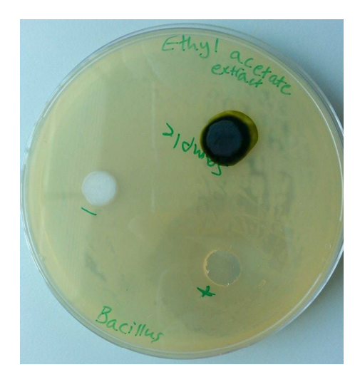
Figure 6. The antimicrobial activity of ethyl acetate extract of leaves of Eruca sativa against Bacillus cereus HAS