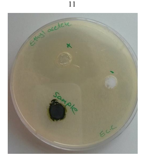
Figure 8. The antimicrobial activity of ethyl acetate extract of leaves of Eruca sativa against Erwinia amylovora HAS 12

Figure 7. The antimicrobial activity of ethyl acetate extract of leaves of Eruca sativa against Escherichia coli HAS