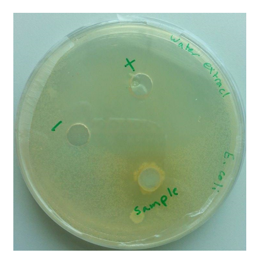
Figure 1. The antimicrobial activity of water extract of leaves of Eruca sativa against Escherichia coli HAS 11

Figures 1 and 2, 3 and 4 present diameters of inhibition zones exerted by the extracts and the standard towards tested microorganisms. Water extract of Arugula leaves was effective against Escherichia coli HAS 11 (19mm) and Staphylococcus aureus HAS 1 (12mm) as shown in Figures 1 and 2, respectively, but no activity was observed against Erwinia amylovora HAS 12 (Figure 3) and Bacillus cereus HAS 2 (Figure 4). In the case of Ethyl acetate extract, no antimicrobial activity against tested microorganisms, Staphylococcus aureus HAS 1 (Figure 5), Bacillus cereus HAS 2 (Figure 6), Escherichia coli HAS 11 (Figure 7) and Erwinia amylovora HAS 12 (Figure 8) was seen.