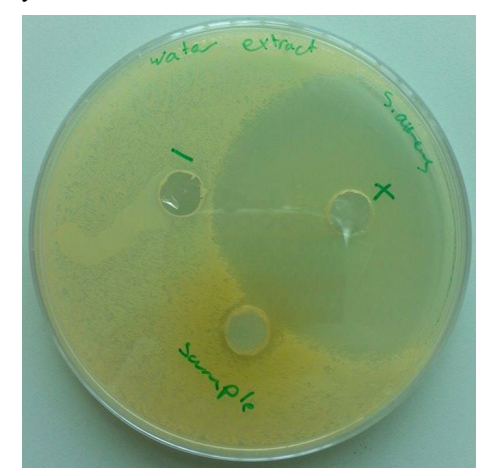
Figure 2. The antimicrobial activity of water extract of leaves of Eruca sativa against Staphylococcus aureus HAS

Figure 1. The antimicrobial activity of water extract of leaves of Eruca sativa against Escherichia coli HAS 11