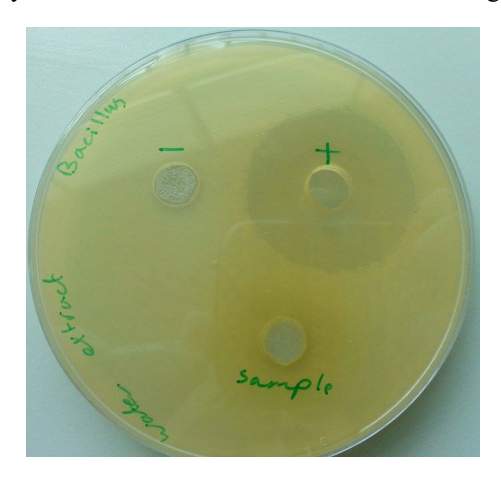
Figure 4. The antimicrobial activity of water extract of leaves of Eruca sativa against Bacillus cereus HAS 2