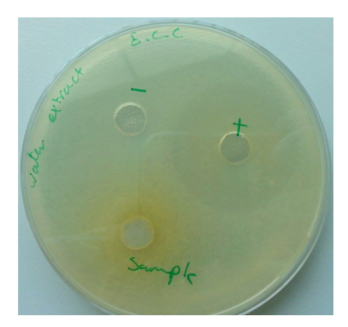
Figure 3. The antimicrobial activity of water extract of leaves of Eruca sativa against Erwinia amylovora HAS 12