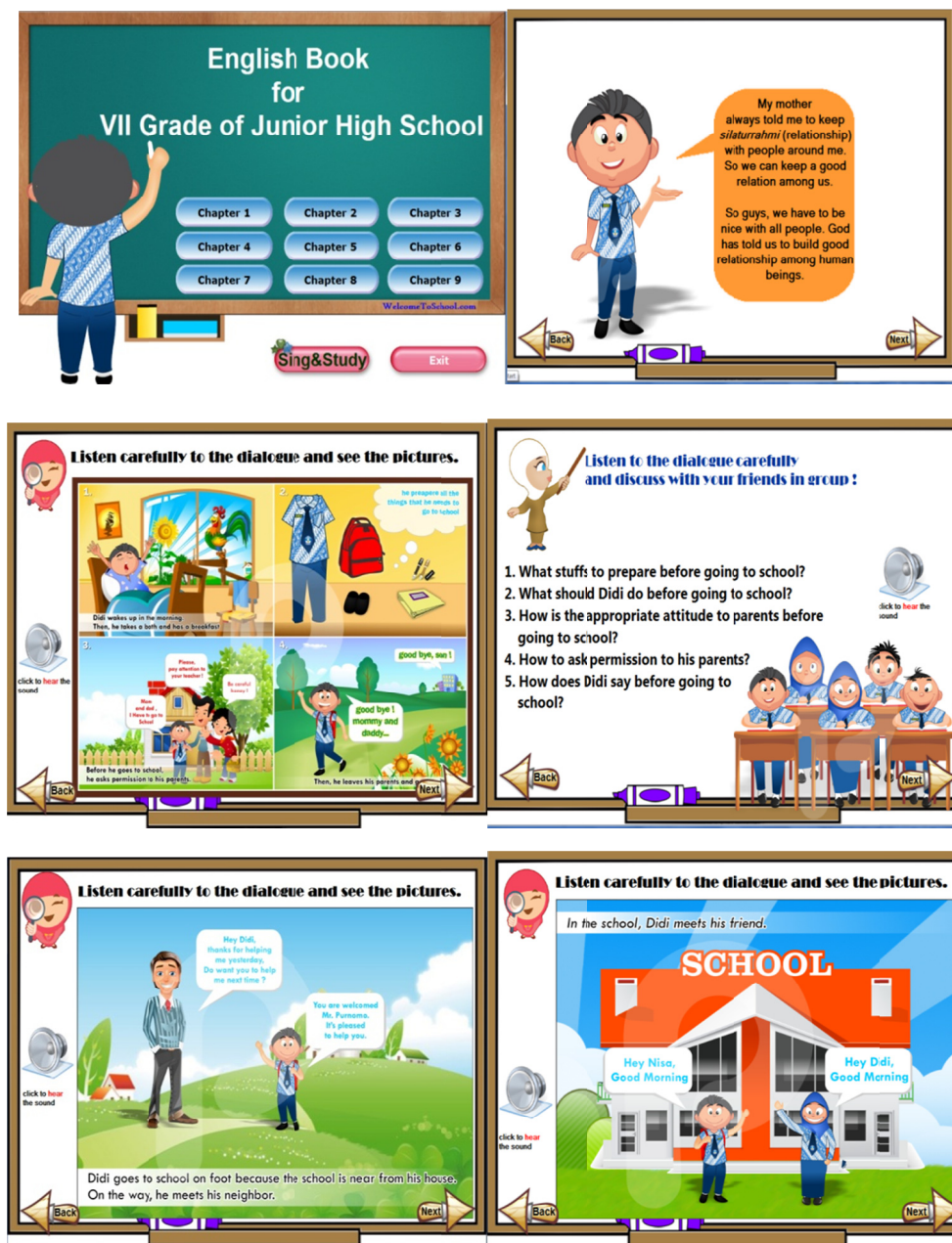
Figure 1. Example of pre-task activities

The following describes a sample of the product of the chapters 1 of this book, which contains steps in accordance with the rules of task-based language learning in the CALL development of curriculum materials of 2013. The example of each task activity of Pre-Task, Whilst-Task and Post Task activity are presented in the following pictures.