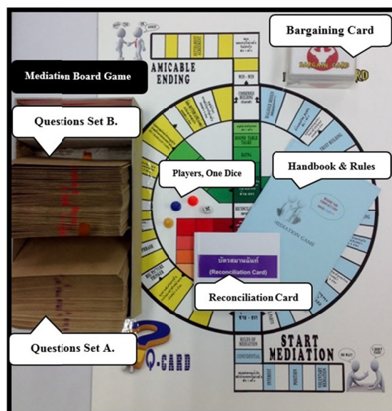
Figure 1. The board game design and other components of the mediation game