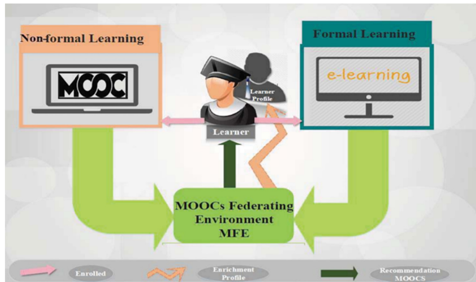
Figure 1. The relation between FEM and formal & non-formal learning platforms

FEM (Federating Environment of MOOCs) was first presented at the European Conference on e-Learning in 2017. To provide differentiated teaching in a federating environment, we can collect students' learning history via the online learning platform of MOOCs (such as Open EdX and Canvas) and set up their learning profiles. The learner profile can be enriched by non-formal learning and offer personalized learning to meet formal learning needs. By achieving the bridge between non-formal and formal learning, FEM can improve the quality of learning (Mrhar, Zary, & Abik, 2017).