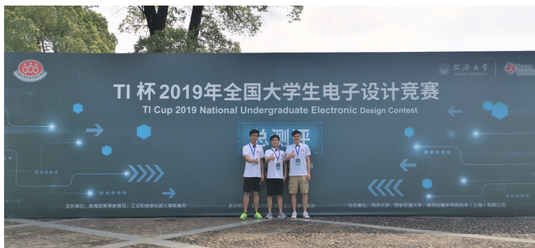
Figure 3. Students at the National Finals of the National Undergraduate Electronic Design Contest 2019

Through the study of this course and other related ones, students can improve themselves in multiple ways, including completing course projects, applying for innovative and entrepreneurial projects for college students, participating in subject competitions, graduation design and employment, and most importantly, students are allowed to learn how to design, implement and run a simple embedded system, and have a certain project development background, be competent for embedded development work immediately and obtain clear advantages in the employment of this major.