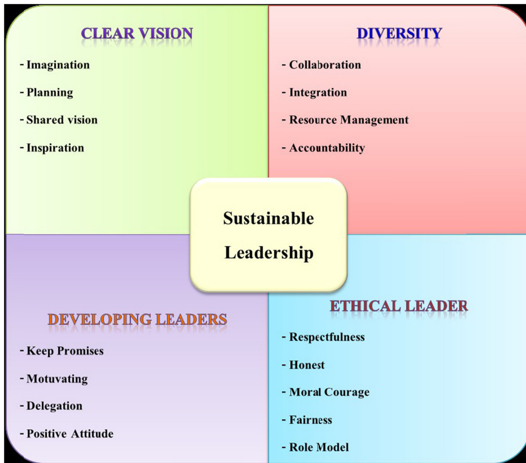
Figure 2. Conceptual framework for implementing the structured relationship model sustainable leadership indicator for secondary school administrators to utilize management

making and evaluation as well as the use of educational management. Moreover, this study can be used as a framework for the development of sustainable leadership for secondary school administrators (Figure 2).