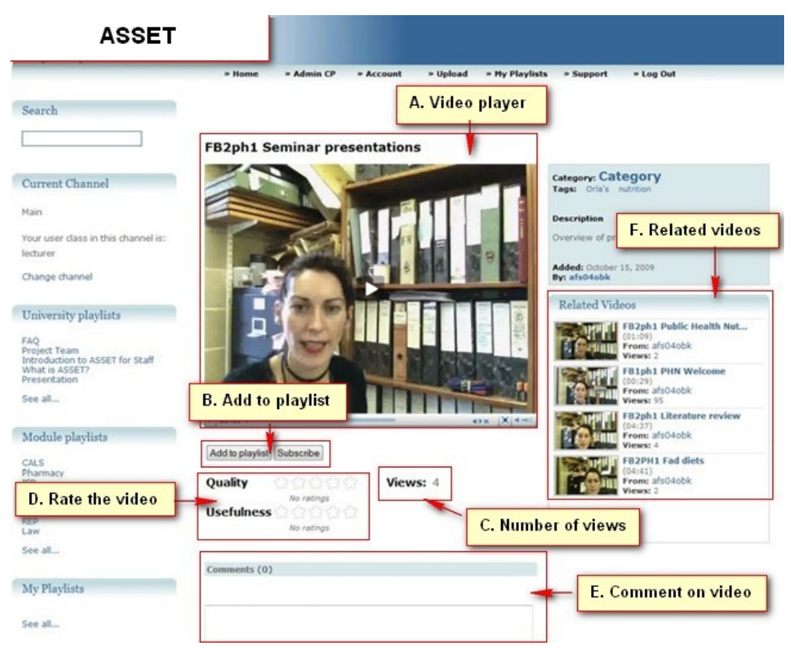
Figure 3. Screenshot of video homepage of ASSET

Each video had its own home webpage where users could interact with the video (A) by adding it to their own playlist (B), rate the video (D) and add comments (E). Related videos (F) were also presented on the basis of similar terms when cataloguing the video on upload. The producer of the video could also see the number of views (C).