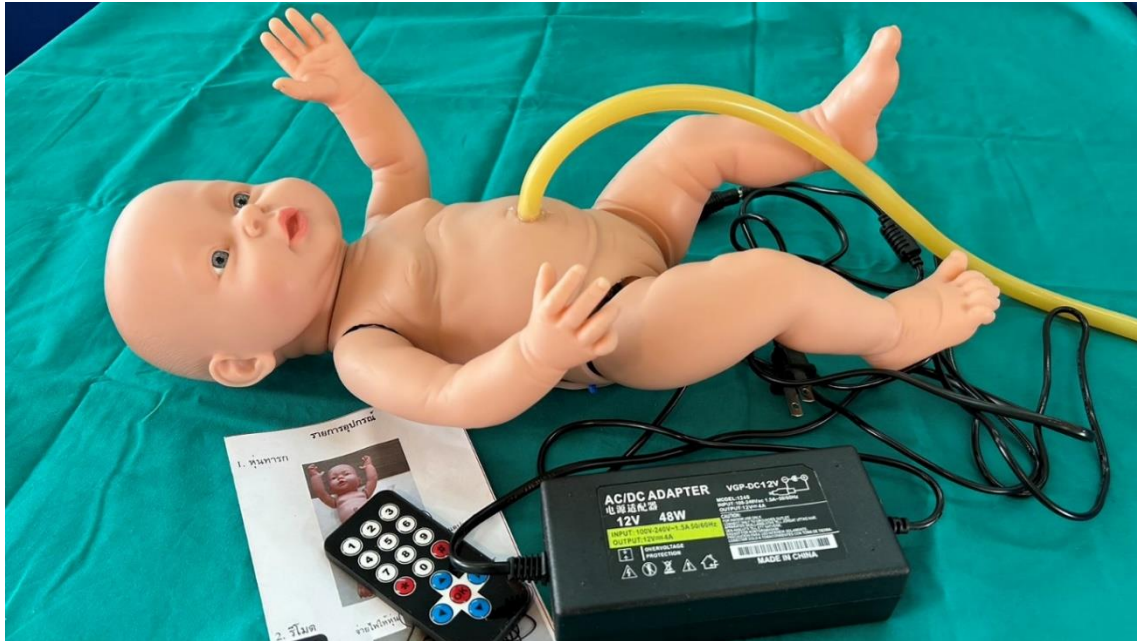
Figure 2. Newborn and umbilical cord in a low-cost model