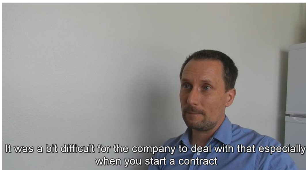
Figure 3. A social worker shares his experience from the field in a video created by the French team ‘Association Transfer’

The narrator shares the story of a female employee in a French company (the names of which are not disclosed), who after an initial ‘good start’ appears as if she has faked sickness. Apparently, according to the narrator, the company makes an ‘attribution error’ (he uses this psychological term), by failing to recognize the employee’s health condition. The narrator goes on to say that the reaction of the employer was to state that ‘this person [the worker] doesn’t work anymore’ (2 min 20 sec), that ‘she is not reliable’ (3 min 36 sec) and ‘if it happens again she will lose her job’ (3 min 42 sec). He describes his role in the situation as ‘to demonstrate that we can’t judge those situations at first sight’ [sic] (3 min 25 sec). He explains the emotions of the employee, who probably faces ‘a number of practical stressors’, like ‘caring for dependents, having her sense of self-reliance compromised, acquiring the identity of a sick person’, and so on. According to the narrator, the employee ‘felt carried’ (4 min 25 sec) ... in the procedure to materialize and prove the fact that she is in a situation that she cannot handle’ (4 min 29 sec).