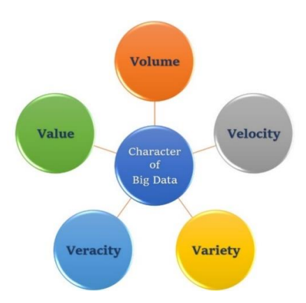
Figure 1. Characteristics of Big Data