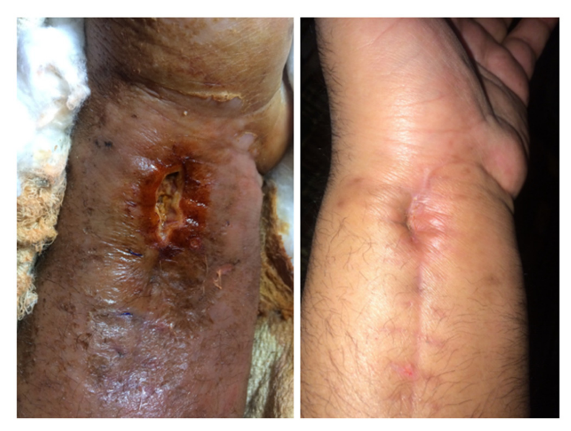
Figure 3. Two Stages of Ulcer's Evolution: Ulcer Formation (left) and Healing (right) ^{\Omega} The photographs have been consented by the patient.