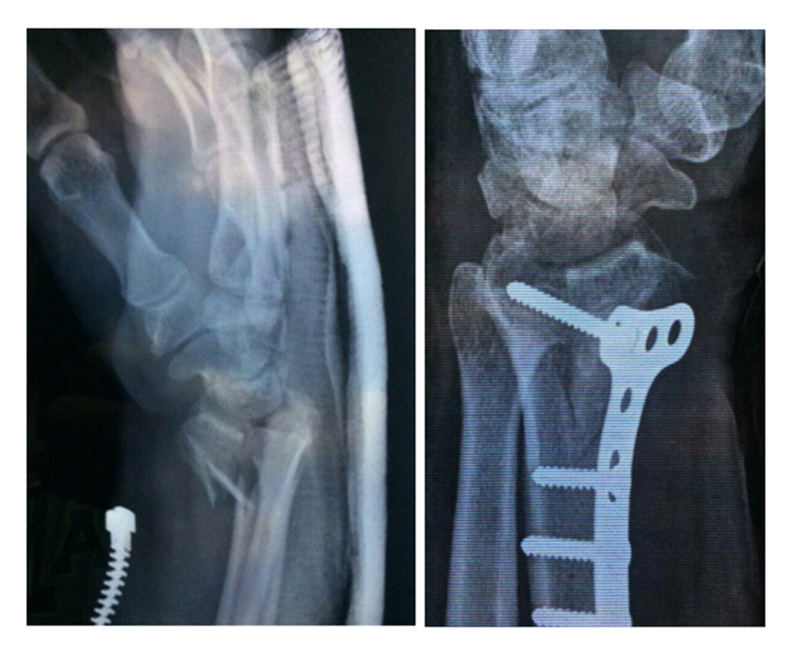
Figure 2. Fracture Site at Distal Radius (left radiograph), Internal Fixation with T-plate and Screws (right) ^{\Omega} The Radiographs have been consented by the patient.

The orthopaedic surgery was successful, although, within few days, the patient started developing skin discolouration followed by erosion and a subsequent ulcer evolution (Figure 3) on the volar aspect of the distal part of the forearm overlying the fixation site. Accordingly, the orthopaedic surgeon decided to refer the patient for a dermatological consultation; the surgeon was also considering the option of removing the T-plate from the fixation site because the fixation might have triggered the ulcer formation. Dermatology consultation confirmed the presence of a moderately-sized ulcer of punched out edges and an unhealthy granulation tissue; the ulcer dimensions were 10 millimetres by 20 millimetres, the longitudinal axis of the ulcer was parallel with the axis of the forearm. It was decided to manage the ulcer conservatively without interfering with the internal fixation; conservative management included the strict application of commercial Acetic acid in the form of apple vinegar. In Iraq, the commercial apple vinegar is sold at an advertised concentration of 4-6%; it was applied three times each day. Eventually, the ulcer healed successfully (Figure 3) within two weeks; a minimal scar tissue formation can be observed.