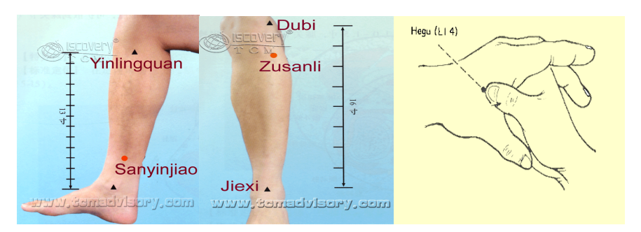
Figure 2. The locations of the acupoints LI4, ST36 and SP6

The oral educational session was supplemented with pamphlets, demonstrating the technique of pressing the true acu-points with accurate duration, showing posters and slides by PowerPoint Software for the experimental group after providing full explanation about the research objective. The same researcher educated the placebo group about the procedure of touching at the same acu-points (except providing pamphlet). One of the required acupoints was L.I.4 or Hegu channel which is the major painless relaxant point. It is located on the dorsum of the hand, between the 1st and 2nd metacarpal bones, in the middle of the 2nd metacarpal bone on the radial side, when the thumb is fully extended, i.e. the bones of the thumb and the first finger. The other is the ST36 point or Zusanli which is to the lateral side of the middle toe, 3 individual cun below the genu, i.e. on the anterior lateral side of the leg, one finger breadth (middle finger) from the anterior crest of the tibia, which is one of the most effective locations for reduction of fatigue and a general balance point. The last point is SP6 or Sanyinjiao, which is on the medial side of the leg, 3 cun above the tip of the medial malleolus, posterior to the medial border of the tibia, is one of the major and most commonly used channels (Molassiotis, Sylt, & Diggins, 2007) which is shown in Figure 2.