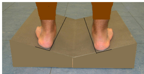
Figure 2. Wooden wedges

Simultaneous mean, first quartile, third quartile, minimum, and maximum values of lumbar lordosis and thoracic kyphosis were compared to each other at 4 measuring positions (the lines at the middle of rectangular which are parallel to length axis are median, two lines which are respectively below and above each rectangular are minimum and maximum, and lower and higher widths are respectively the first and third quartiles). It is obvious from this figure that with increasing angle of the wedge, the values of minimum, the first quartile, median, the third quartile and the maximum all increased (Figure 2).