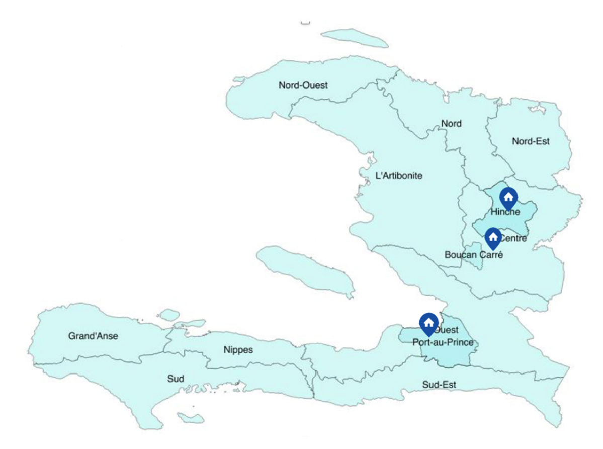
Figure 1. Map of Haiti displaying the location of the drug-resistant TB (DR-TB) treatment facilities (blue pins) of the country.

An alternative to hospital-based care is the community-based model in which MDR-TB treatment is initiated in patients' homes or in local clinics (Loveday et al., 2015). This approach has been shown to be more cost-effective than a hospital-based model (Fitzpatrick & Floyd, 2012). It brings care providers closer to patients' homes and families (Loveday et al., 2015) and helps reduce disease transmission in the community through rapid introduction of appropriate treatment (Dharmadhikari et al., 2014).