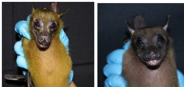
Figure 2. Dobsonia viridis and D.exoleta

The distribution of bat species caught in the present study can be seen in Table 4. There were 14 species of 10 genera rat trapped in Muna regency. The most captured bats were Dobsonia viridis (n=19) (Figure 2), followed by Rousettus celebensis (n=18) and Styloctenium wallacei (n=14, endemic species of Sulawesi). The endemic bat species trapped were Dobsonia exoleta , D. viridis , Eonycteris spelaea , Nyctimene cephalotes , Pteropus alecto , Rousettus celebensis , and Styloctenium wallacei (Figure 3). Dobsonia viridis and Rousettus celebensis were the most caught species (20.93%). Dobsonia viridis was most commonly found in the NFNS ecosystems and trapped in gardens and yards where papaya trees grew up. Whereas Rousettus celebensis was found in NFDS ecosystem and trapped in gardens and CNS ecosystem and trapped in the yard with papaya and guava vegetation. The second highest percentage was of Styloctenium wallacei (16.78%). Like Dobsonia viridis , this species was often found in the Non-Forest Near Settlement ecosystem.