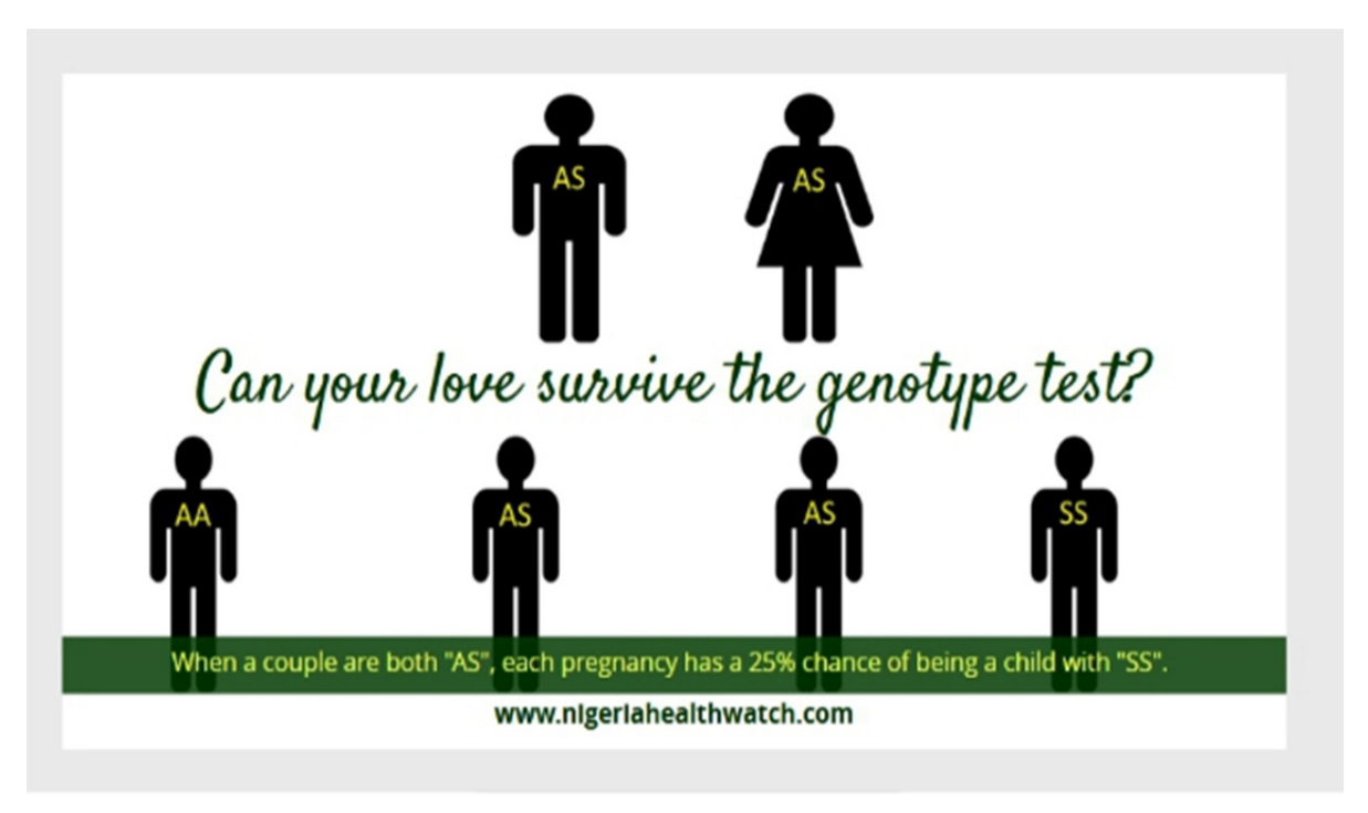
Figure 2. Pictorial illustration for genotype compatibility in a relationship

At this point, it is necessary to state that educating the public through the mass media cannot be graded successfully until every relationship with foresight of marriage to begins considers the priority of genotypic compatibility before letting the fire of emotion and love to burn. It is quite imperative to access the compatibility of your genotype and any prospective partner before you say yes to an individual you intend to marry. This intervening concept in a relationship is very much different from phenotypic description or acceptability. An individual can be phenotypically compatible but genotypically incompatible (www.aun.edu.ng/index.php/campuslife/health-center/health-tips/genotype-compatibility).