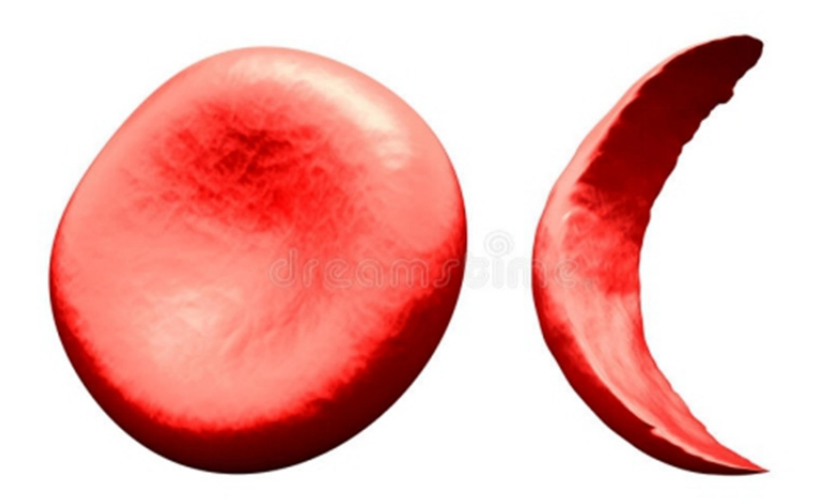
Figure 4. An illustration of differences in the morphology of a normal shaped erythrocyte and a Sickle-shaped erythrocyte

physiological risk factors of SCD (Larissa, 2018). An individual with the disease has a sickle-like shaped erythrocyte (Red Blood Cell) instead of the normal erythrocyte. This deformation causes difficulty in the movement of blood within the blood vessels and a reduction in the amount of required oxygen to the rest parts of the body (http://oncofertility.northwestern.edu/resources/sickle-cell-anemia).