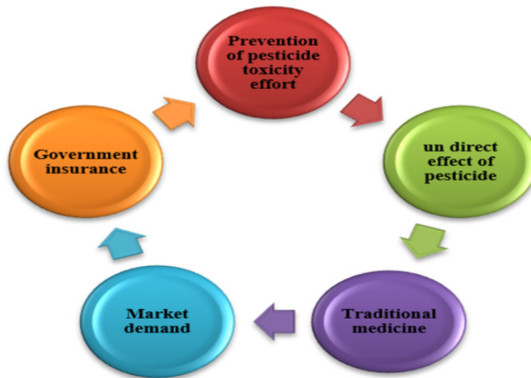
Figure 2. Farmer's Health Belief Model