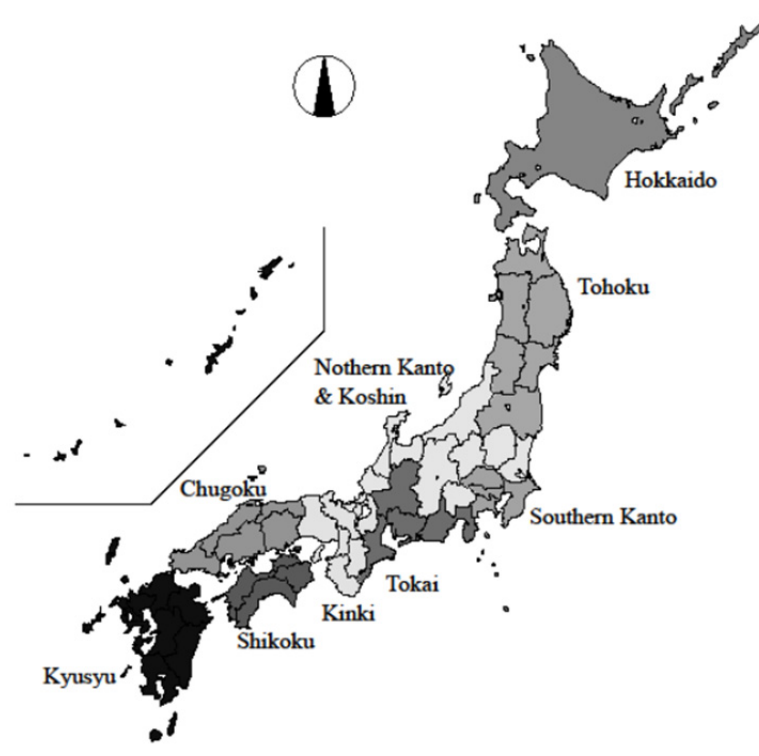
Figure A. The geographic area on a map