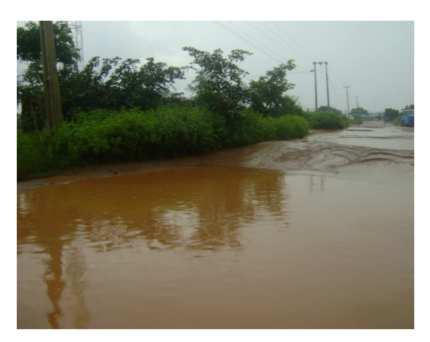
Figure 2. Stagnate water on the road in Ilorin after a heavy downpour