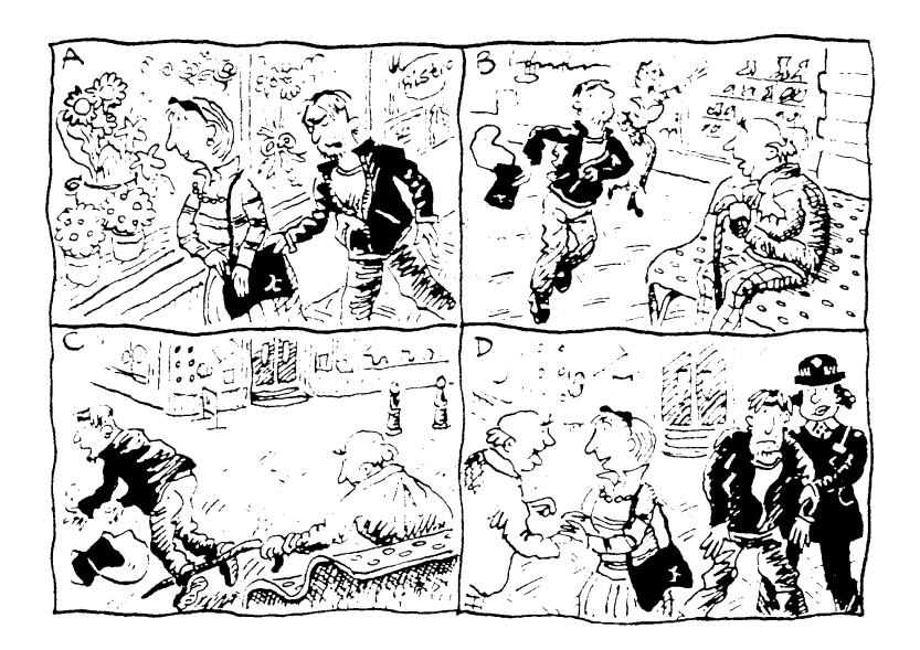
Figure A. Pictures for descriptions in the writing task