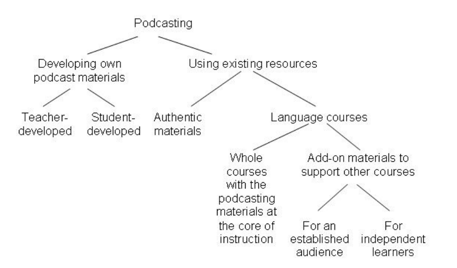
Figure 1. Podcasts uses Taxonomy for language learning (adapted from Rosell-Aguilar, 2007, p. 476)

Coupled with the teaching-driven podcasts usage, McGarr (2009) reviewed the literature of higher education and outlined three significant usages which are: (1) substitutional to review lectures attended; (2) supplemental to deepen understanding with extra materials; and (3) creative to encourage students to record new podcasts as a course requirement. Among the three usages, supplemental was well received by both teachers and students because of its enrichment feature. Also, Al Qasim and Al Fadda (2013) pointed out that in language learning (LL), podcasts can either consist of materials designed by students to contextualize their LL or readily available authentic listening content such as news, audio events or speeches. Furthermore, Rosell-Aguilar (2007) enriched the podcasts literature with a broader perspective that guided future studies. He classified the online authentic podcasts materials into two groups; 1) podcasts provided and used by native speakers and 2) podcasts designed for language learning and course. He reviewed materials by relating them to the Second Language Acquisition (SLA) theories and suggested taxonomy for using podcasts in LL, presented in Figure 1.