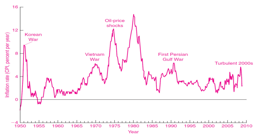
Figure 2. Inflation rate over 60 years (Samuelson & Nordhaus, 2010)

Having presented the frequency change of inflation over 83 years, the metaphorical expressions of inflation over TMC and the relevant resonance of each source domain, it would be more fruitful to discuss the observed findings in the light of the social-cultural context that inflation metaphor has been used over almost 100 hundred years. For that purpose we will compare linguistic data against economic data from a well-known economic textbook Economics (Samuelson & Nordhaus, 2010). Figure 2 shows inflation rate in the United States over sixty years. Clearly inflation was variable, and it reached unacceptable high rates in the early 1980s. However, it has moved in a narrow range in recent years. The general trend based on economic data as in Figure 2 is similar to that attested from corpus data as shown in Figure 1.