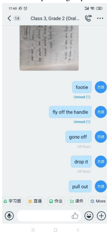
Figure 4. Teacher’s reply