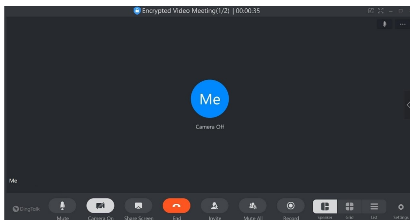
Figure 2. Interface of DingTalk online classroom (with the teacher in only)