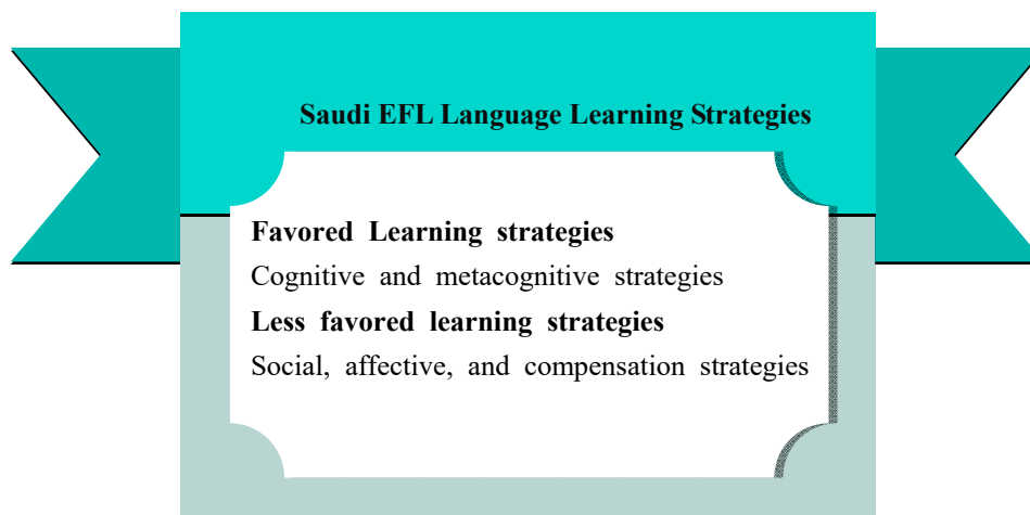
Figure 2. Saudi EFL Language Learning Strategies

To address Saudi EFL students' infrequent use of learning strategies and their failure to use the full range of strategies, teachers need to provide additional and more frequent opportunities for students to use appropriate language-learning strategies in different instructional tasks and activities. Moreover, the language strategies students were found to use least frequently, including affective, memory, and compensation strategies, should constitute the core of classroom strategy instruction. Teachers can help students use such strategies effectively by matching their teaching styles to each student's learning style and selecting appropriate instructional methods, tools, and materials to maximise students' use of learning styles and strategies. Ultimately, these measures will enhance the development of Saudi EFL learners' linguistic abilities.