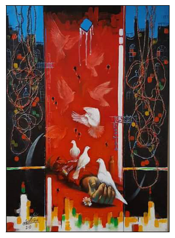
Painting 7. "Waiting for Peace" by Atheed Tarik

• Translator 4: The anger whale is coming which the Iraqi people and Mosul will be saved and come back again by the desire of God and Deash will be defeated inevitably.