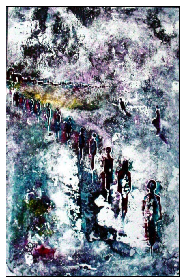
Painting 1. "The displacement" by Anwar Darweesh