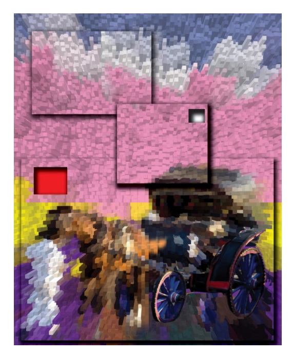
Painting 8. "Wheel of War" by Bayaat Mar'ae