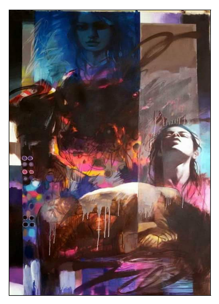
Painting 4. "Kidnapped Yazidi Girls" by Khulaif Mahmood

It seems that the interpretations of the teachers of translation are totally comprehensive and influential. Consequently, translation is able to convey the suffering of the tragedy within and after the period of Daesh.